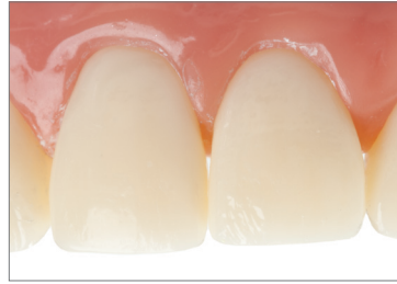
Opal Seal primer is translucent after curing.